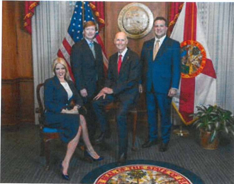
Rick Scott Governor